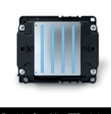
PrecisionCore MicroTFP printhead