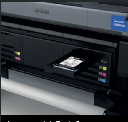
Integrated Ink Pack System