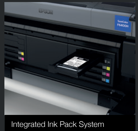
Integrated Ink Pack System